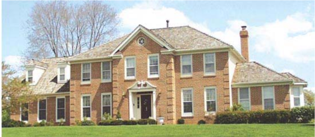
Designed in partnership with ADP Total Source and US Inspect, the nation's leading home inspection company

For more than a decade US Inspect has built a reputation for excellence with top-quality inspections and world-class service. With over 1.3 million inspections under our belt you will receive the highest quality inspection and service in the home inspection industry.